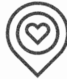
Serve the Community