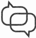
Share Your Story